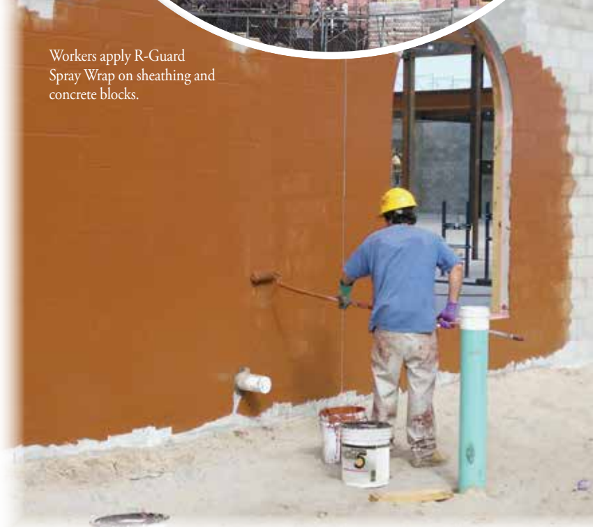
A technician uses a roller to easily apply R-GUARD Cat 5 to concrete block.