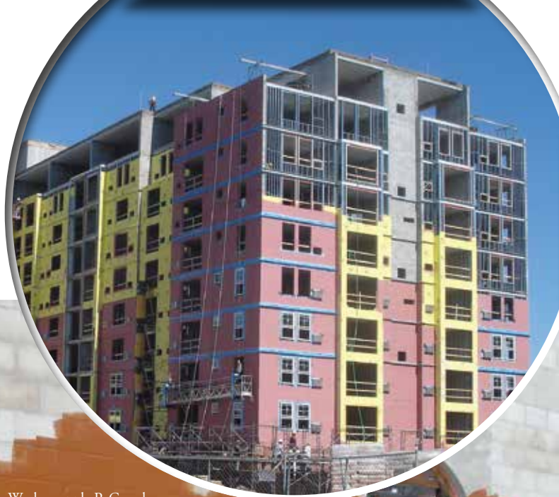
Workers apply R-Guard Spray Wrap on sheathing and concrete blocks.

Water-based, vapor-impermeable, air- and water-resistive VB minimizes damaging air and water intrusion into structural walls.