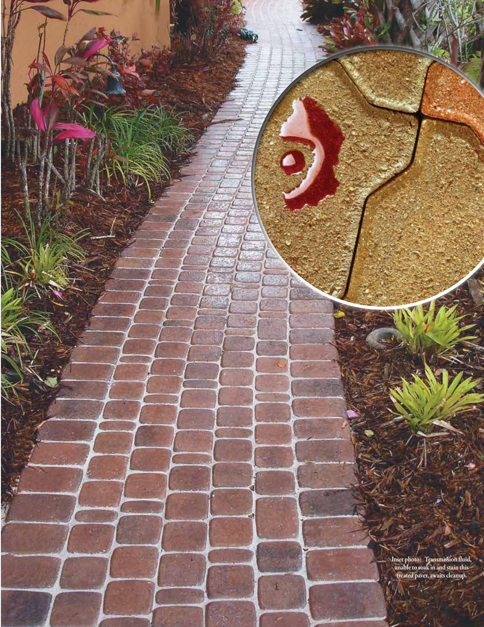
Inset photo: Transmission fluid, unable to soak in and stain this treated paver, awaits cleanup.