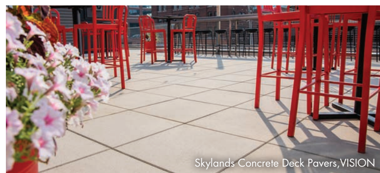
Skylands Concrete Deck Pavers, VISION