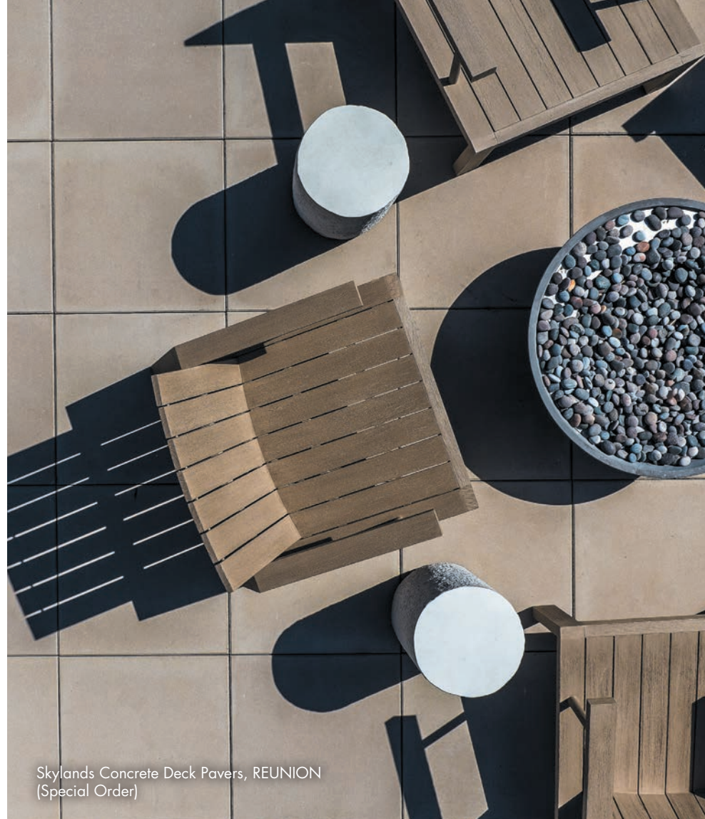
Skylands Concrete Deck Pavers, REUNION (Special Order)

23\frac{13}{16} \times 2 \times 23\frac{13}{16}