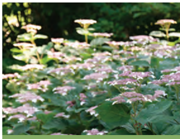
INVINCIBELLE LACE® 4-5' tall + wide | USDA 3-8