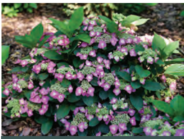
TUFF STUFF TOP FUN™* 2-3' tall + wide | USDA 4-9