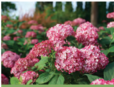
INVINCIBELLE® RUBY* 2.5-3' tall + wide | USDA 3-8