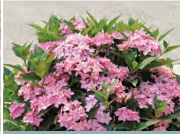
LET'S DANCE CAN DO!®* 3-4' tall + 3' wide | USDA 4-9