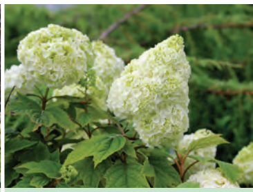
GATSBY MOON® 6-8' tall + wide | USDA 5-9