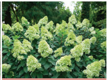
LIMELIGHT PRIME® 4-6' tall + 4-5' wide | USDA 3-8