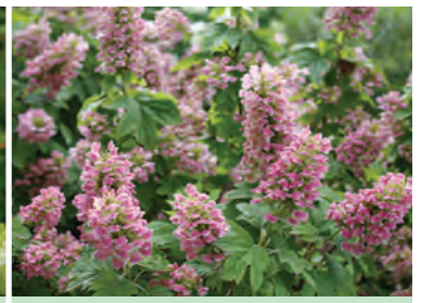
GATSBY PINK® 6-8' tall + wide | USDA 5-9