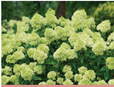
LITTLE LIME® 3-5' tall + wide | USDA 3-8