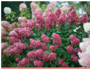
FIRE LIGHT® 6-8' tall + wide | USDA 3-8