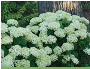
INVINCIBELLE LIMETTA™* 3-4' tall + wide | USDA 3-8