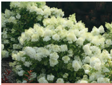
BOBO® 2.5-3' tall + 3-4' wide | USDA 3-8