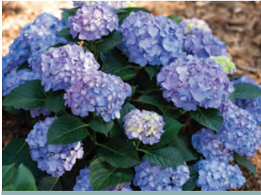
LET'S DANCE® BLUE JANGLES® * 1-2' tall + 2-3' wide | USDA 5-9