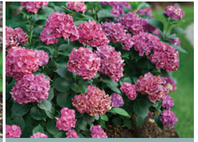
LET'S DANCE BIG BAND®* 2.5' tall + wide | USDA 5-9