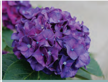
WEE BIT GRUMPY® 2' tall + 2.5' wide | USDA 5-9