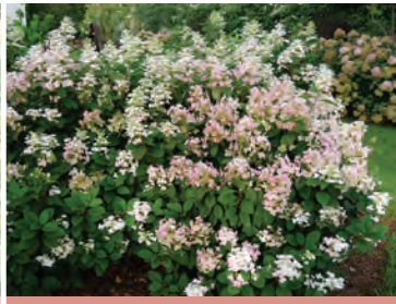
LITTLE QUICK FIRE® 3-5' tall + wide | USDA 3-8