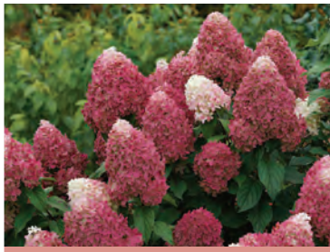
QUICK FIRE FAB® 6-8' tall + 5-6' wide | USDA 3-8