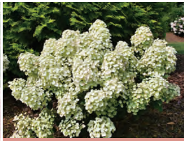
TINY QUICK FIRE® 1.5-3' tall + 2-3' wide | USDA 3-8