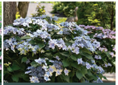
TUFF STUFF AH-HA®* 2-3' tall + wide | USDA 5-9