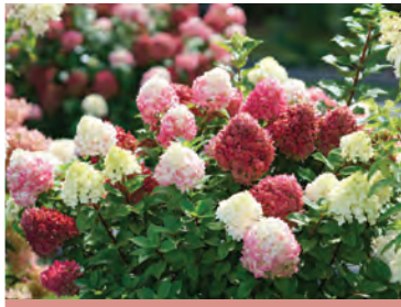
LITTLE LIME PUNCH® 3-5' tall + wide | USDA 3-8