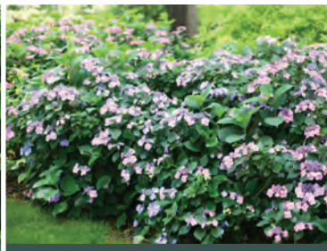
TUFF STUFF™* 2-3' tall + wide | USDA 4-9