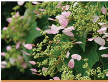
ROSE SENSATION™ 40-50' tall + wide | USDA 5-9