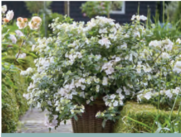
FAIRYTRAIL BRIDE® 4' tall + wide | USDA 6-9