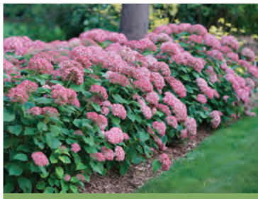
INVINCIBELLE® SPIRIT II* 3.5-4' tall + wide | USDA 3-8