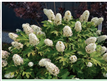
GATSBY GAL® 5-6' tall + wide | USDA 5-9