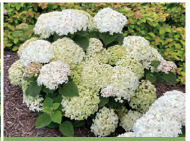
INVINCIBELLE WEE WHITE®* 1-2.5' tall + wide | USDA 3-8