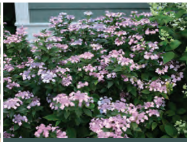
TINY TUFF STUFF™* 1.5-2' tall + wide | USDA 4-9