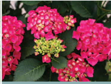
CITYLINE® PARIS 1-2' tall + wide | USDA 5-9