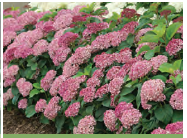
INVINCIBELLE MINI MAUVETTE®* 2.5-3' tall + wide | USDA 4-8