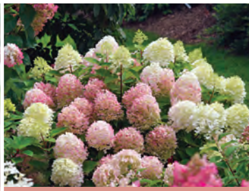
FIRE LIGHT TIDBIT® 2-3' tall + 3' wide | USDA 3-8