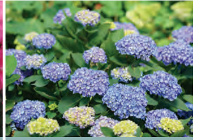
LET'S DANCE® RHYTHMIC BLUE®* 3-4' tall + wide | USDA 5-9