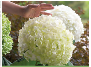
INCREDIBALL® 4-5' tall + wide | USDA 3-8