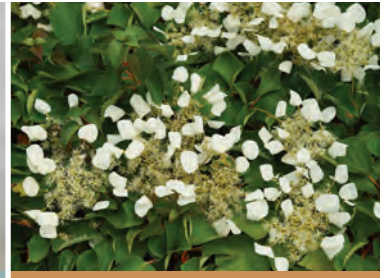
FLIRTY GIRL® 40-50' tall + wide | USDA 5-9