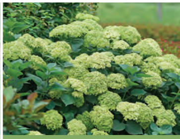
INVINCIBELLE SUBLIME™ 3.5-5' tall + wide | USDA 3-9