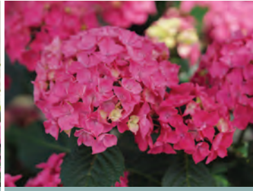
LET'S DANCE LOVABLE™* 3-4' tall + wide | USDA 5-9