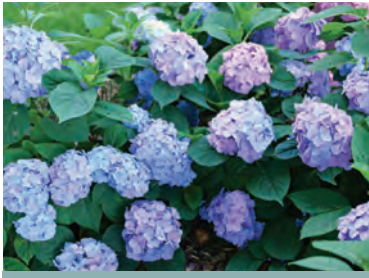
LET'S DANCE SKY VIEW®* 2-3' tall + 2-4' wide | USDA 4-9