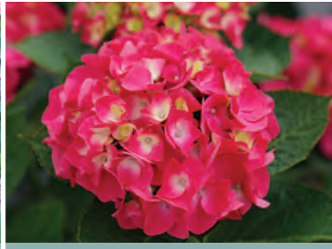
WEE BIT GIDDY®* 2' tall + 2.5' wide | USDA 5-9