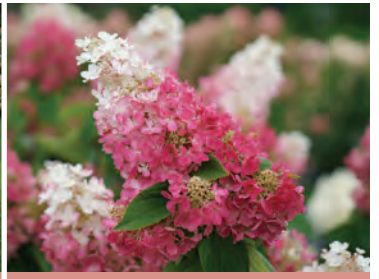
PINKY WINKY PRIME™ 6-9' tall + wide | USDA 3-8