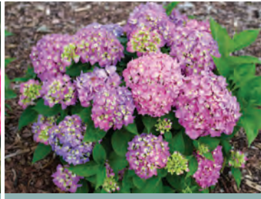
LET'S DANCE ¡ARRIBA!®* 2-3' tall + wide | USDA 4-9