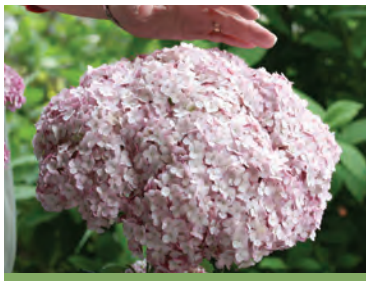
INCREDIBALL® BLUSH 4-5' tall + wide | USDA 3-8