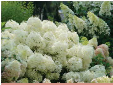
PUFFER FISH® 3-5' tall + wide | USDA 3-8