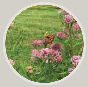
Pollinator and Rain Garden applications