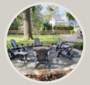
Fire pit or seating area with plants