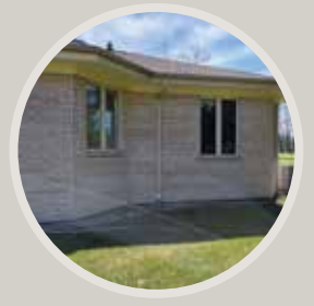
Planting near foundation walls and windows