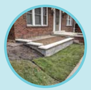
Raised planters and garden walls under 24"