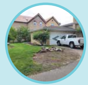
Planting along driveway