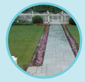
New walkway (requires dedicated appointment if larger than 200SF)