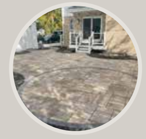
New patio design up to 500 SF (requires dedicated appointment)