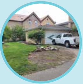
Planting along driveway