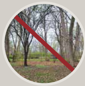
No heavily wooded yards (Limit 3-4 trees with locations shown on sketch or plat)