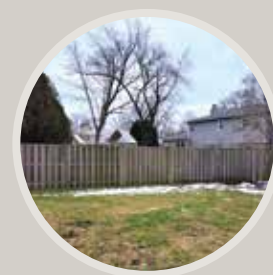
Privacy screening along fence or property line