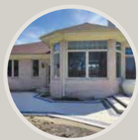
Planting around a newly constructed patio (Include sketch or plan)