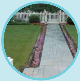
New walkway (requires dedicated appointment if larger than 200SF)