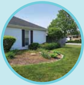
Lawn design with planting beds