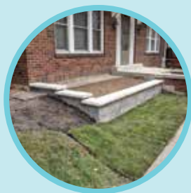
Raised planters and garden walls under 24"