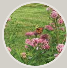
Pollinator and Rain Garden applications