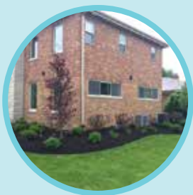
Corner lots (additional fee may apply)