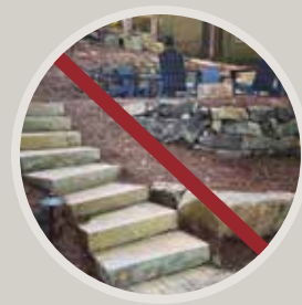
No multi-level grade changes (Limit to two levels)