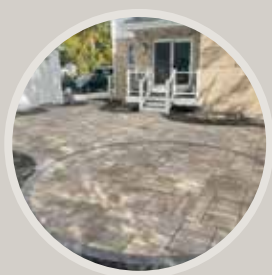
New patio design up to 500 SF (requires dedicated appointment)