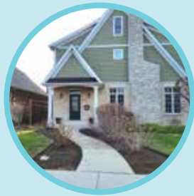
Front planting beds for curb appeal