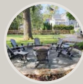
Fire pit or seating area with plants