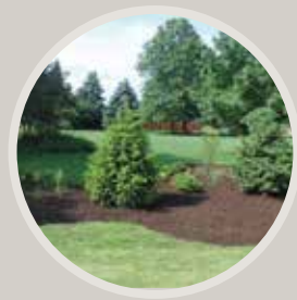
Planting berms or islands (Include sketch)