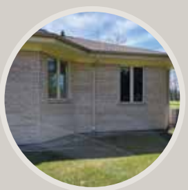
Planting near foundation walls and windows